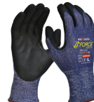
G-Force Ultra C5 Cut Resistant Glove GCF178