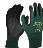
G-Force Ultra C3 Cut Resistant Glove GCT177